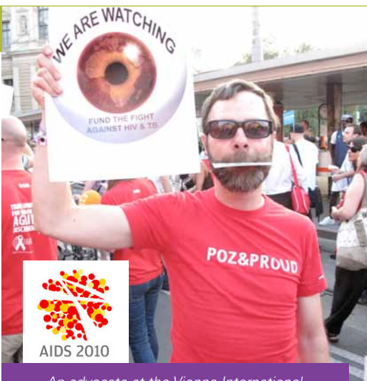
An advocate at the Vienna International AIDS conference in July

Information, research and discussion were presented on topics that seemed